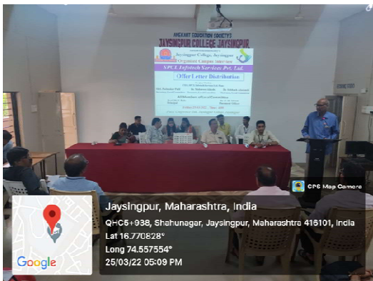
Jaysingpur, Maharashtra, India QHC5+938, Shahunagar, Jaysingpur, Maharashtra 416101, India Lat 16.770828° Long 74.557554° 25/03/22 05:09 PM