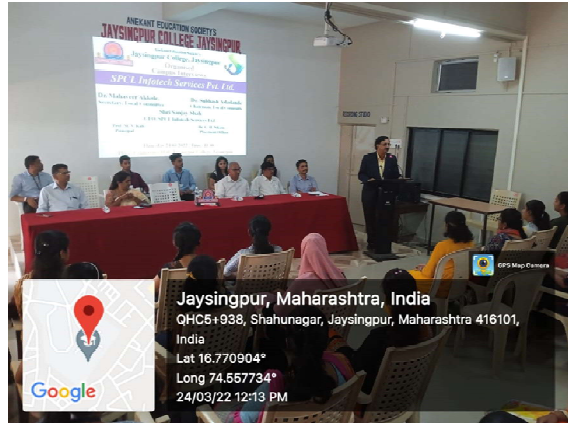
Jaysingpur, Maharashtra, India QHC5+938, Shahunagar, Jaysingpur, Maharashtra 416101, India Lat 16.770904° Long 74.557734° 24/03/22 12:13 PM