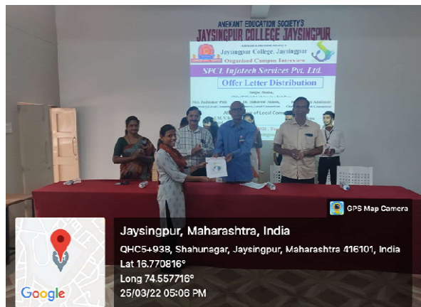
Jaysingpur, Maharashtra, India QHC5+938, Shahunagar, Jaysingpur, Maharashtra 416101, India Lat 16.770816° Long 74.557716° 25/03/22 05:06 PM