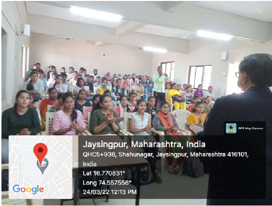
Jaysingpur, Maharashtra, India QHC5+938, Shahunagar, Jaysingpur, Maharashtra 416101, India Lat 16.770831° Long 74.557558° 24/03/22 12:13 PM