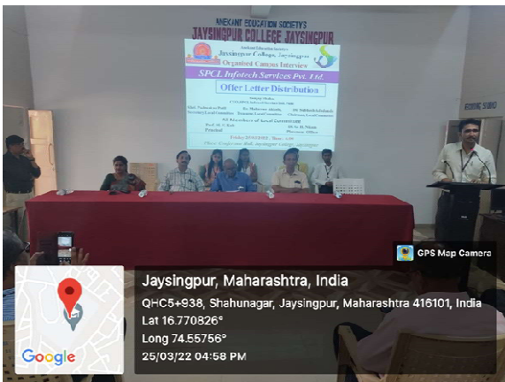
Jaysingpur, Maharashtra, India QHC5+938, Shahunagar, Jaysingpur, Maharashtra 416101, India Lat 16.770826° Long 74.55756° 25/03/22 04:58 PM