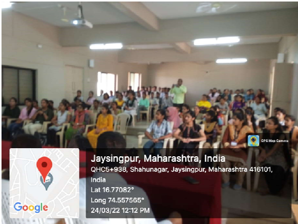
Jaysingpur, Maharashtra, India QHC5+938, Shahunagar, Jaysingpur, Maharashtra 416101, India Lat 16.77082° Long 74.557565° 24/03/22 12:12 PM