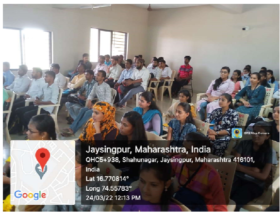
Jaysingpur, Maharashtra, India QHC5+938, Shahunagar, Jaysingpur, Maharashtra 416101, India Lat 16.770814° Long 74.55783° 24/03/22 12:13 PM