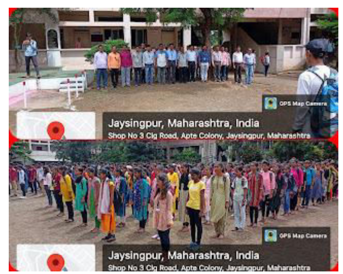
Group National Anthem Singing in Jaysingpur College

Jaysingpur: In view of the completion of 75 years of Indian Independence, the activity "Azadi Ka Amrit Mahotsav" i.e. "Amrit Mahotsav of Freedom" is being organized all over the country. Various programs were organized at various levels under the activity which continued till August 15, 2023. In this, Jaysingpur College Actively participated.