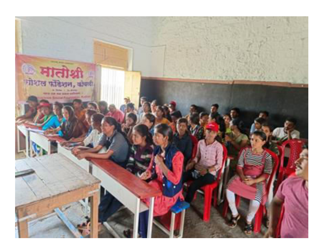
Glimpse of Event