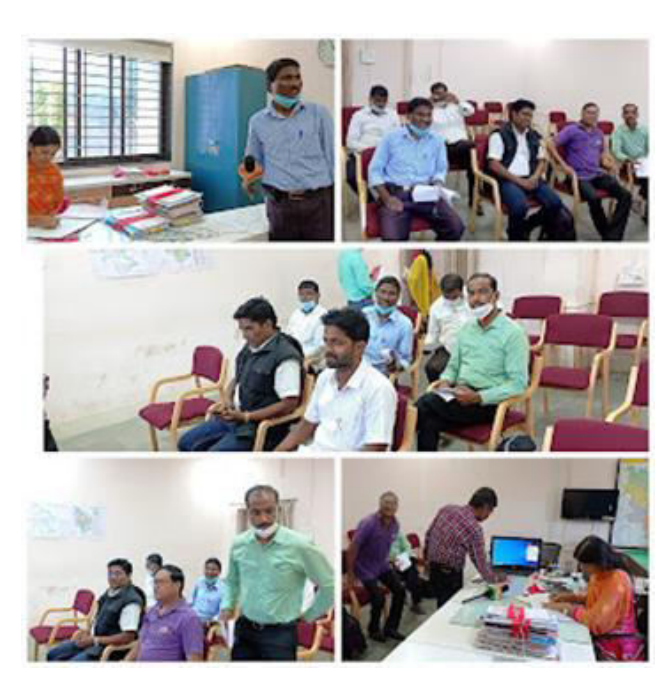
Glimpse of New voter awareness and registration campaign