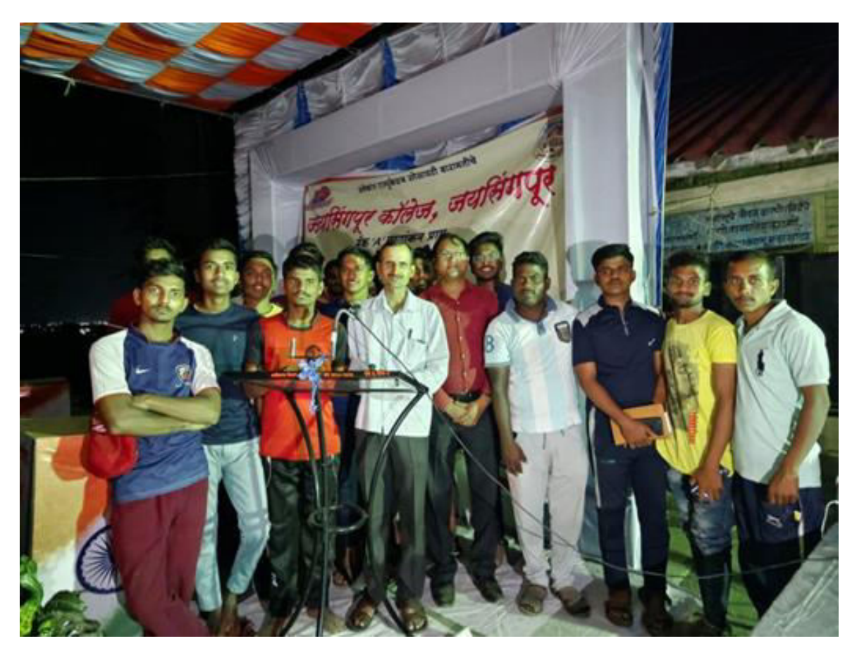
Glimpse of Organization of Shram Sanskar Shibir (Labor camp)