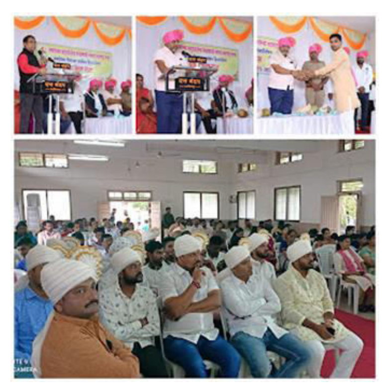
Glimpse of 'Corona warrior' honour award event