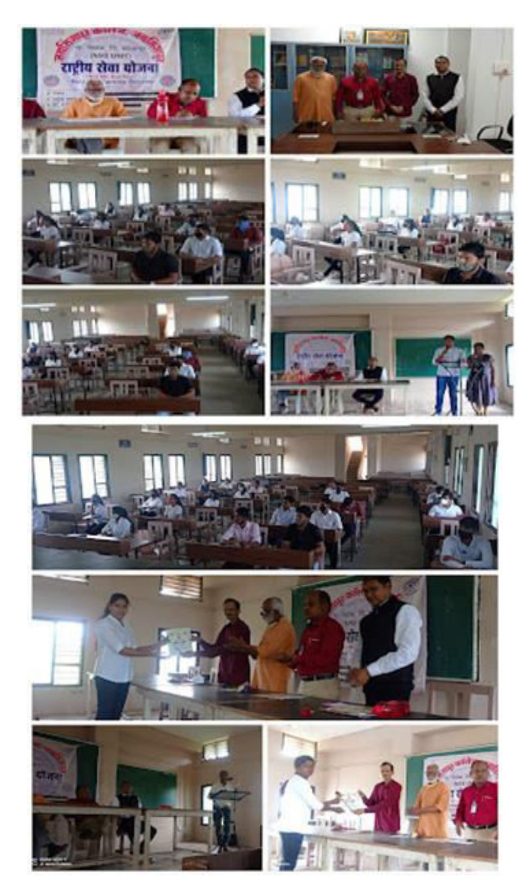
Glimpse of Pulse Polio Immunization 2021 and Certificate distribution program