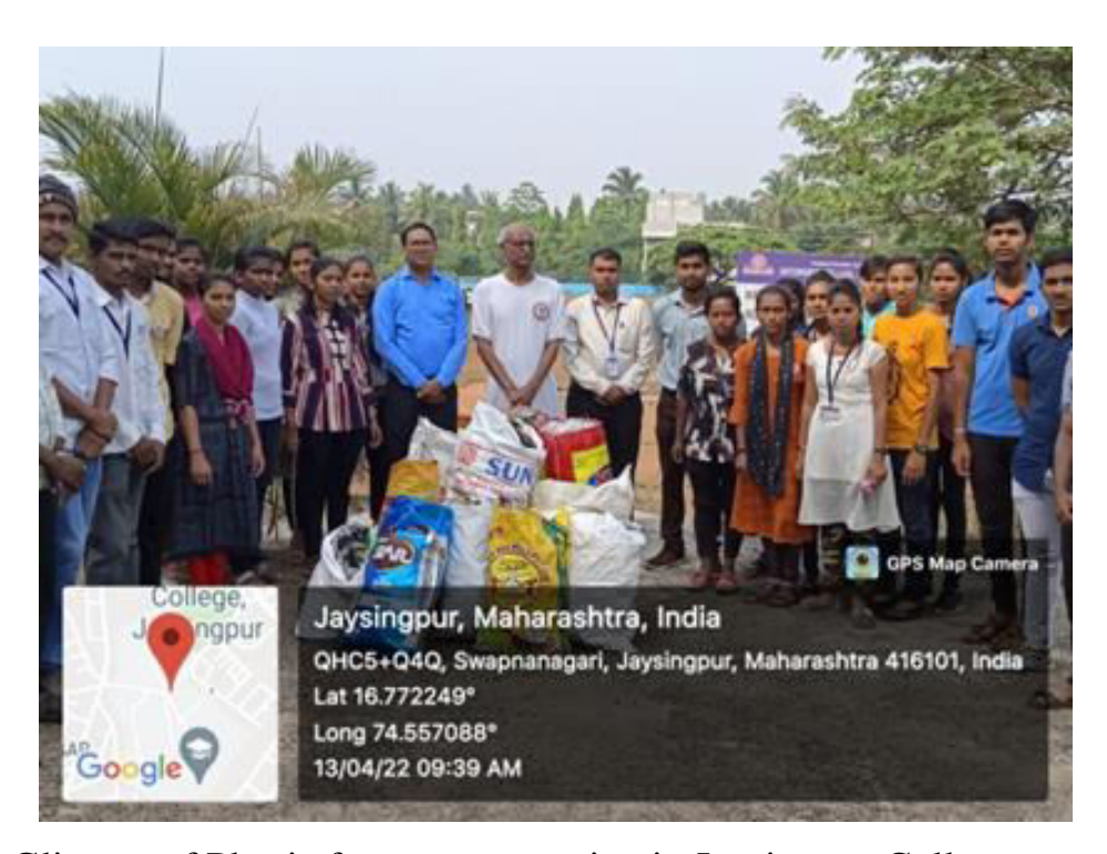
Glimpse of Plastic free area campaign in Jaysingpur College