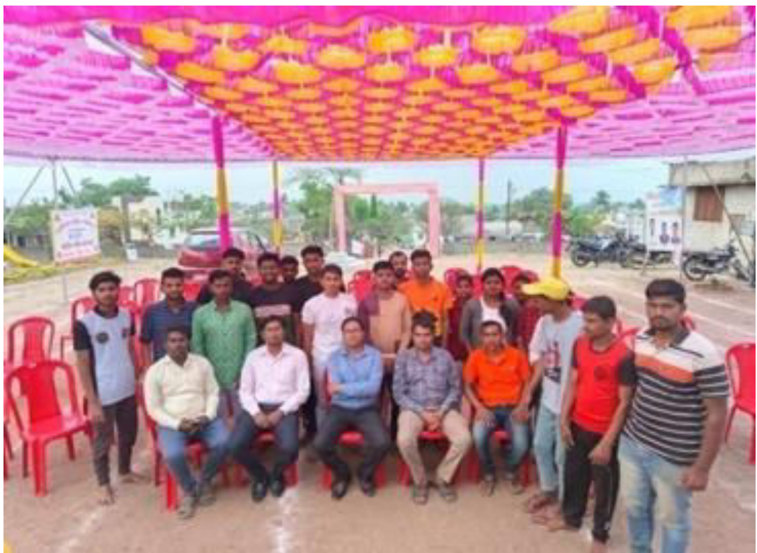
Glimpse of Guest Lecture on Financial investment and tax planning guidance