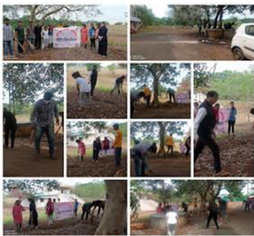
Glimpse of Swachh Bharat and Green Oath Program