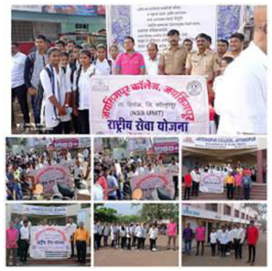
Glimpse of Constitution Jagar Rally