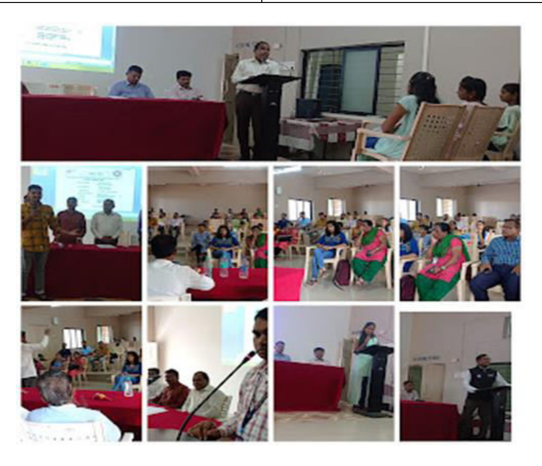
Glimpse of Mass reading and lecture on the occasion of Constitution Day