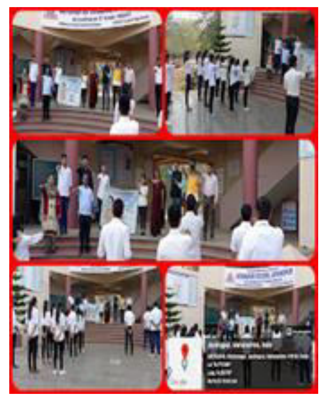
Glimpse of Celebration of National Voters day